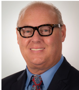
John Kirkpatrick Medical Center Psychiatry