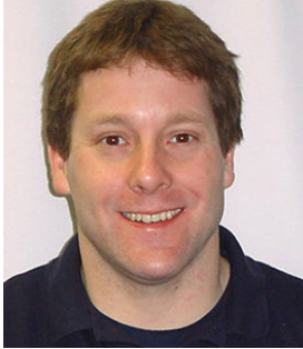
Don Brod Medical Center EMS