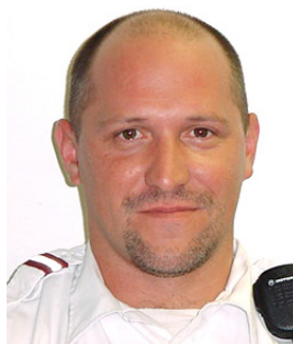
David Duncan Medical Center EMS