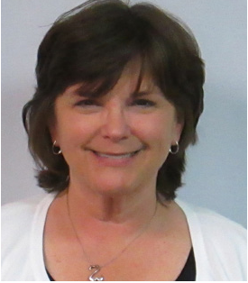
Sonya Creek Commonwealth Financial Resources