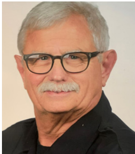
Gary Madison Medical Center EMS