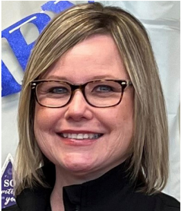
Tobi Dukes Med Center Health Primary Care Auburn