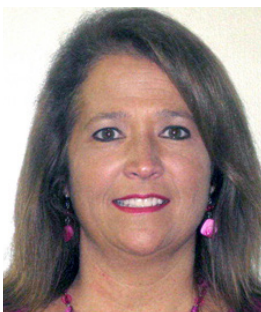
Kay Meade Medical Center EMS