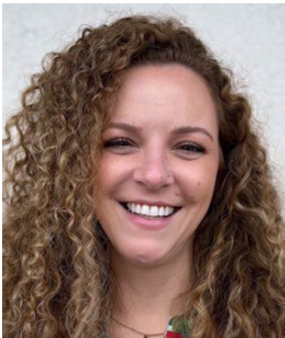
Senka Basic Hillcrest Credit Agency