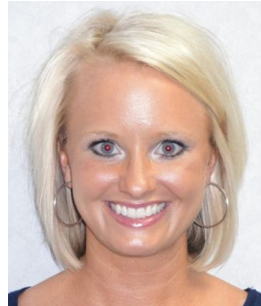
Suzanne Woodward Center Care