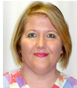
Vickie Crick Med Center Health Adult Day Center