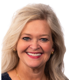
Kim Mitchell Center Care