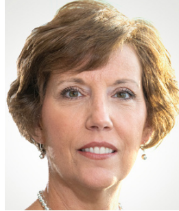
Glee Lenoir MCBG Pharmacy