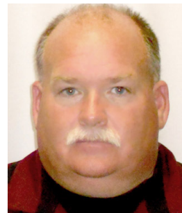
Lanny Shields Medical Center EMS