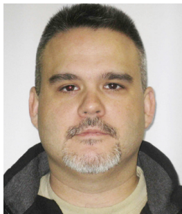
Steven Carpenter Medical Center EMS