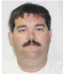
Robert Doughty Medical Center EMS