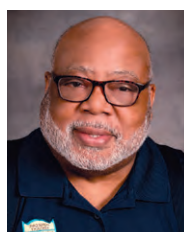
Mayor Randall Curry