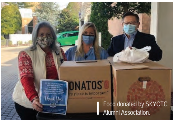
Food donated by SKYCTC Alumni Association.

Med Center Health Foundation was a link with community leaders and played a part in delivering food and gift baskets and cards of encouragement to our staff. This generosity from our community helped all employees keep going. Your compassion continues to be a true testament to our partnership with the Southcentral Kentucky region.