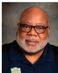
Mayor Randall Curry