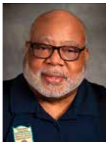
Mayor Randall Curry