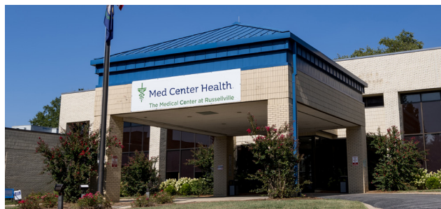
Med Center Health acquired Logan Memorial Hospital in July 2024 which became The Medical Center at Russellville.