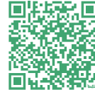
Med Center Health Diversity Video

In 2023, Med Center Health formed the first-ever committee dedicated to enhancing diversity, equity and inclusion efforts across the organization. Made up of staff from across the system, the Equity and Connection Committee’s mission is to “provide guidance and recommendations to the senior leadership of Med Center Health on matters related to diversity, equity, and inclusion.”